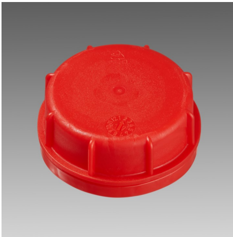
Screw cap KV51 neutral