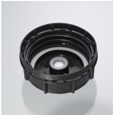
Screw cap KV51 neutral with venting